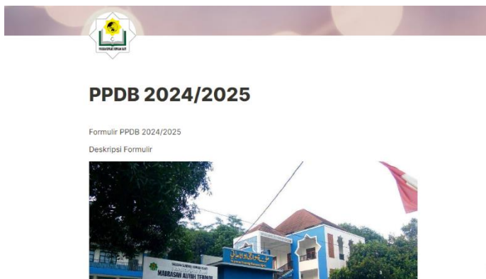
Figure 3. Main web page