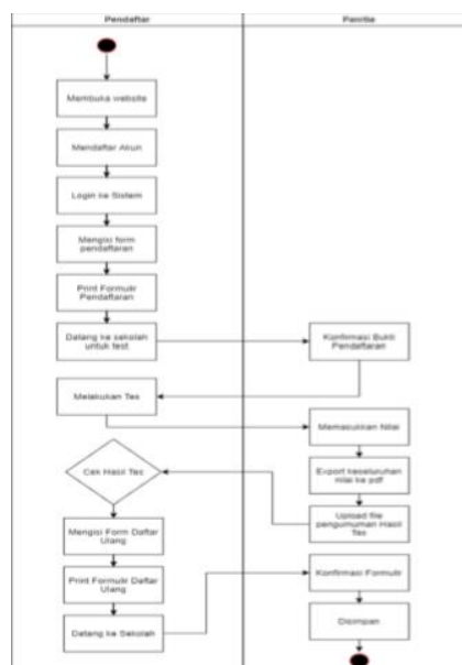
Figure 2 Activity process diagram

Activity diagrams are used to describe how a system will generally behave if it is passed down from another actor, in this case, a parent. This diagram shows how parents will facilitate the process of registering new students, conducting recertification, providing information about potential students for selection, and determining who the new student actually is. The following activity diagram illustrates the entire process being carried out: